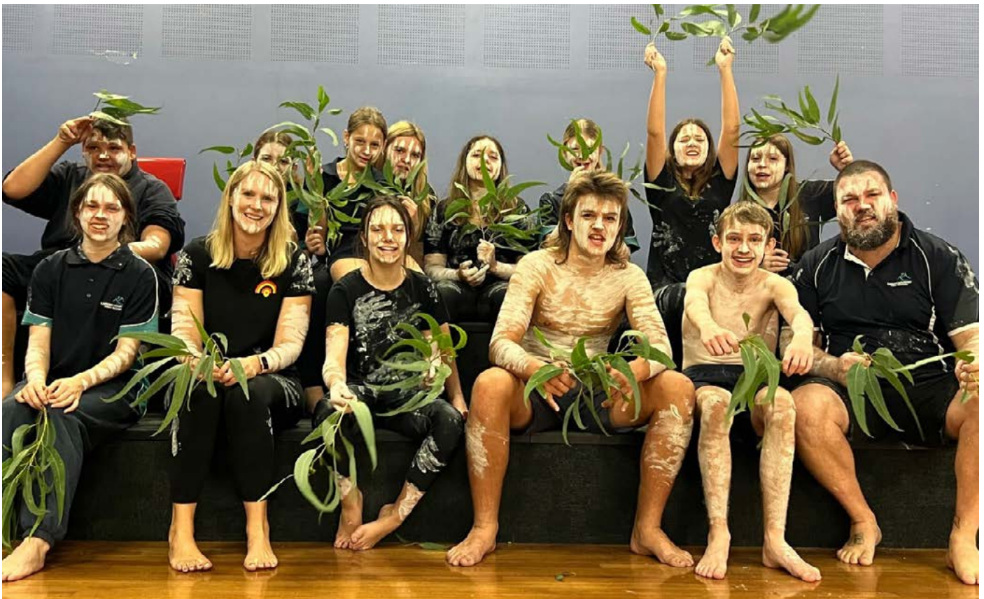
Group photo of KMHS Combined Aboriginal Dance Ensemble

We have always incorporated Aboriginal Studies into our curriculum so that as our students learn about the history of our country, they gain an even better understanding of how our values; Unity Knowledge Respect align with the goals of reconciliation.