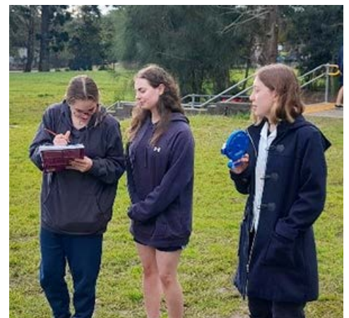
Clinometers (for measuring angles), tape measures, recording sheets and a little bit of SOH, CAH, TOA!! Recipe for success in one of the recent Year 9 classes.