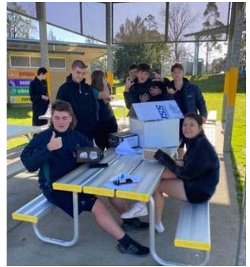
Students recording temperatures using infrared thermometers. Houses were placed in the sun for 20 minutes and then moved to the shade for 10 minutes to determine whether their houses successfully meet the design brief.