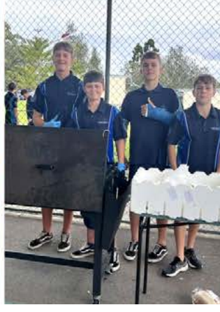
Photo spread showing entrepreneurial Year 8 and Year 9 commerce students with their fabulous stalls in full swing!