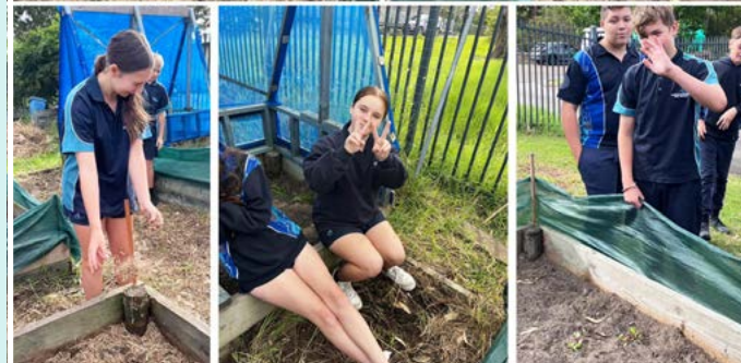
Year 7 and 8 Bara students have been hard at work preparing their sustainable gardens this week. We look forward to seeing the produce they will create.