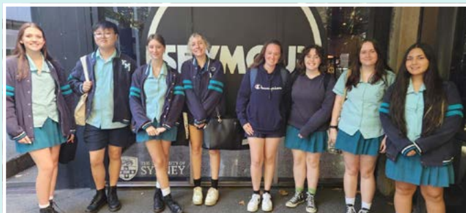
Year 12 Advanced English visited the Seymour Centre to learn about their Common Module text 'The Crucible'