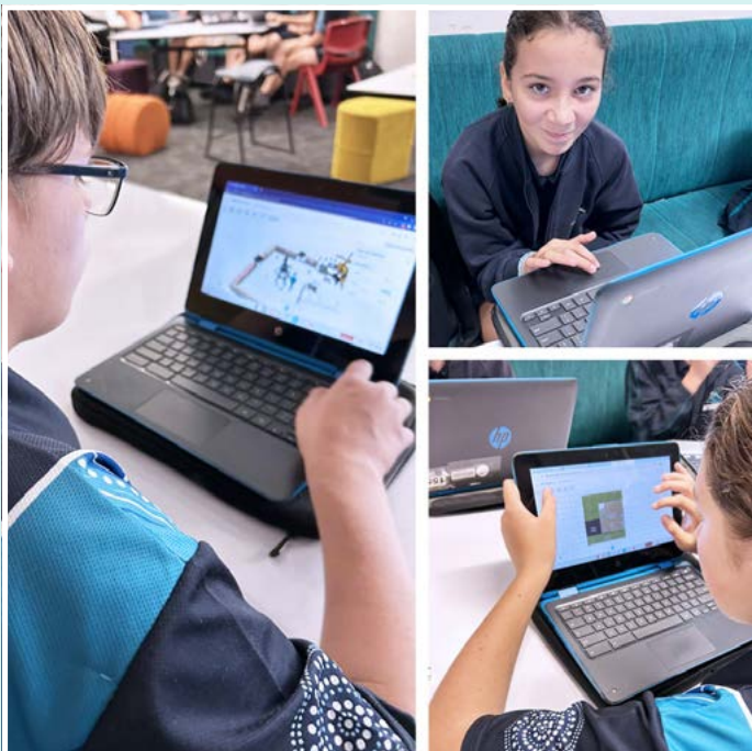
Bara students tackling sustainable living by design.

Year 7 and 8 Bara class have been working hard on their latest project. They are designing their very own 'tiny home', as they study and learn about sustainable living.