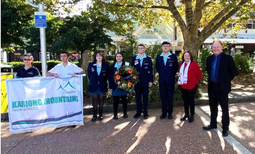
KMHS students and staff at the 2024 Anzac Day Service in Gosford.